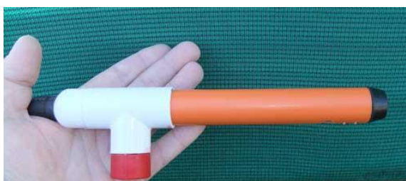
1. 90° Nest Box Inspection Camera

High power Cree light emitting diode on the camera head illuminates inside of the nest box. Live colour video is viewed in real time on the LCD monitor which records either video or still images to a micro SD card. Camera is suitable for use on nest boxes with entry holes larger than 27mm diameter.