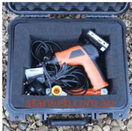
16. Packing Procedure

Carefully close case ensuring that no cabling is jammed & secure the two catches.