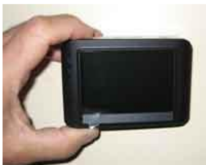
2. LCD Wireless Video Monitor

ON/OFF Power button is located on the top of the monitor. Press the button briefly to turn the monitor ON . Do not switch ON while connected to charger . To turn off, hold down the power button 3 seconds until the monitor turns OFF .