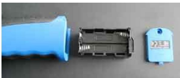
6. Remove the battery cover