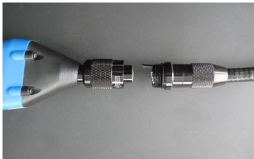
9. Align the plug & socket

The cable from the Nest Camera must be connected to the Hand Control. Inspect the connector socket & plug to ensure they are clear of dirt or debris.