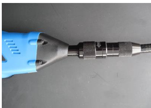
10. Tighten the knurled retainer ring